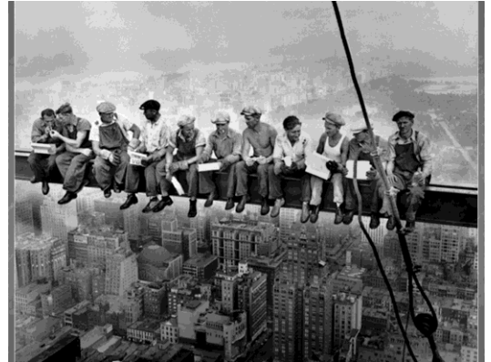
Fig.1 Workers in a evident non-safe condition.

A detailed evaluation of the equation representing IPESHE requires to test consistent but theoretical considerations on actual workplaces of industries. Once the procedure is well established, its use allows to define the priority of interventions for improvements, so that the management process becomes more effective and efficient.